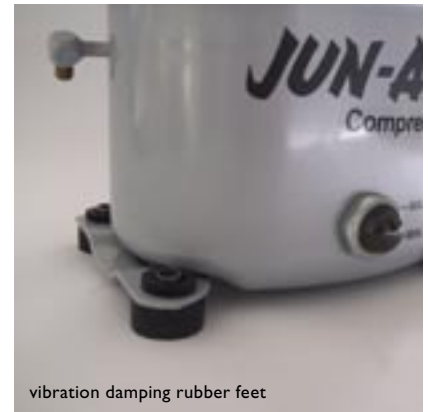
vibration damping rubber feet