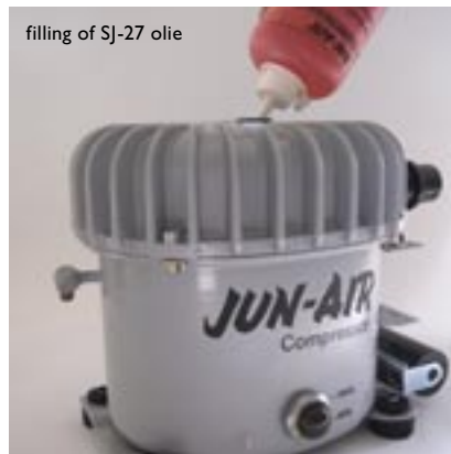
filling of SJ-27 olie